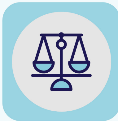
Step 2 RISK ADJUSTED WEIGHTS

Each day, a further mechanism is implemented: