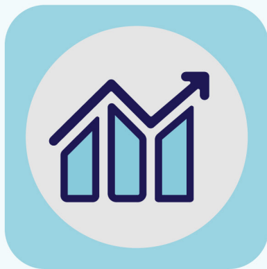
Step 1 MOMENTUM

The index has a 3-step rebalancing process built upon key financial concepts.